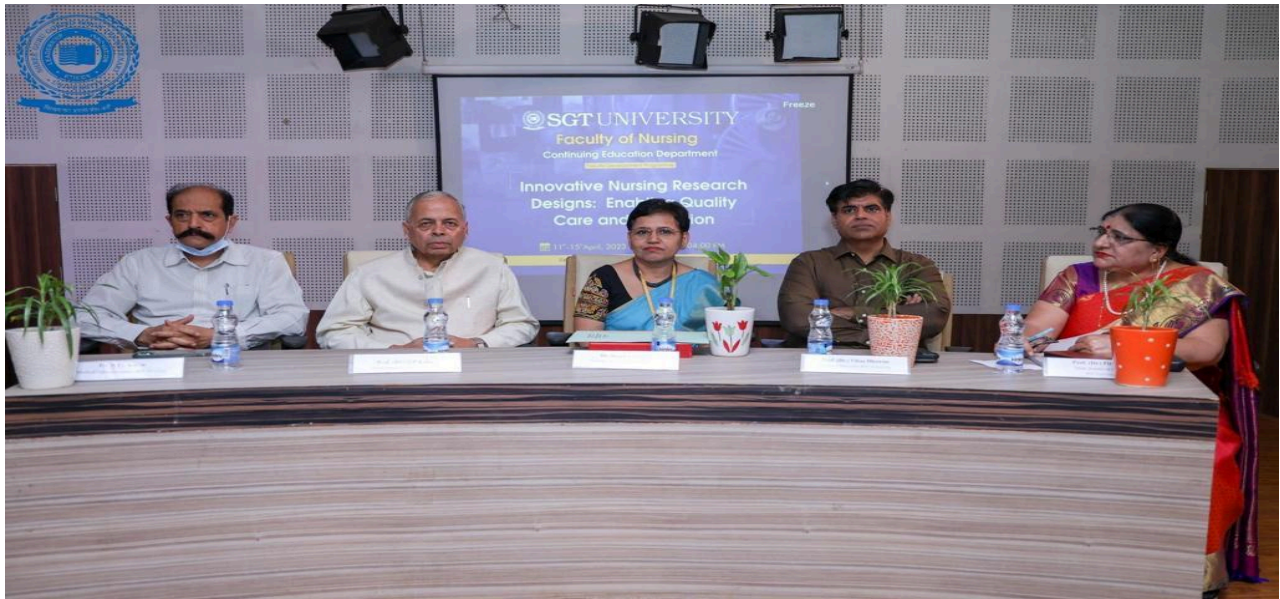
Inauguration of the FDP