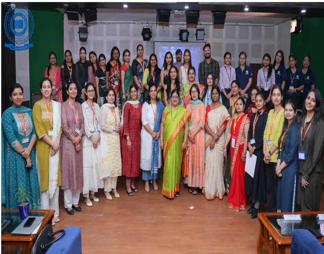
Organizers and the Participants of the event